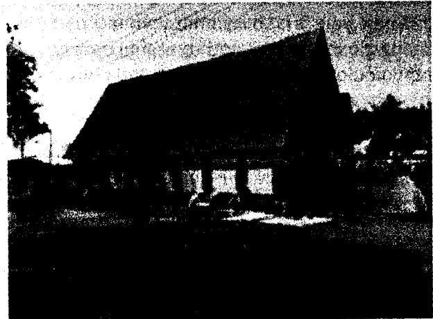
Martin Luther church on the grounds of the clinic in Zambia

The morning devotion presents our faith and teachings as Lutherans to others, indeed sharing the gospel to others is a great opportunity that MLRHC offers to the 25,000 patients who visit the clinic each year. Our staff are also reminded of the great love He demonstrated by sending for us our Lord and Saviour Jesus Christ. It is a reminder that we as Christians need to remain selfless and not to focus on personal gain or advantage but, instead to have compassion and actively focus on the care and needs of other people and to serve them with humility by valuing other people above self. Patients and clients come from very long distances to receive the health and spiritual care we offer; hence we must be a clinic that encourages, shows compassion in Christ and loves all people.