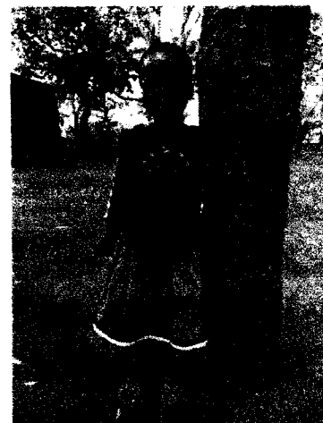
A young girl waiting for her mother outside the clinic in Malawi.