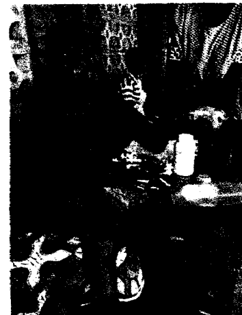
CAMM staff member distributing medications.

WWW.INSTAGRAM.COM/CENTRAL_AFRICA_MEDICAL_MISSION/