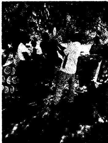
The process of checking the weight of a baby.