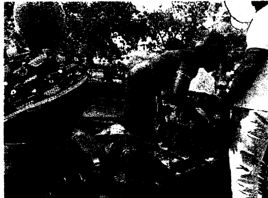
Measuring the length of a baby.