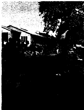
CAMM staff giving a health talk on growth charts at the clinic in Zambia to new mothers.

During my visit to the Mobile Clinic in Malawi and the clinic in Zambia I was filled with comfort and joy as I observed the hard work and dedication of the staff and watched as the items our Contact Women have lovingly packaged and sent were put to good use. Families traveled on foot with young children and older relatives to be cared for each day. Each day began with the word of God and everyone waited with such patience for the medical attention they needed. The staff found joy in their purpose and never complained about the work that God had called them to do each day. It was an inspiration to witness and a reminder for me to be every thankful for the blessings God has showered on this important mission field.