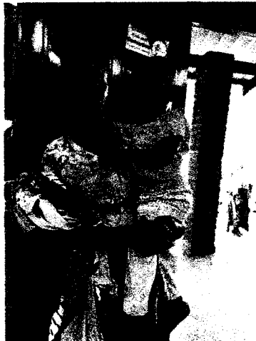
Mom and her son waiting to visit with a clinician at the clinic in Malawi.